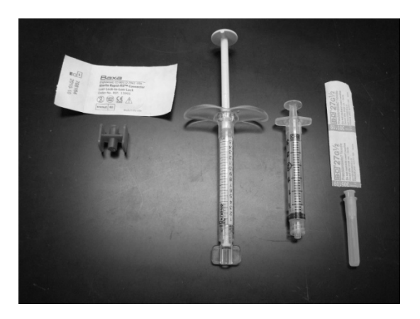
Figure 1: Left to right: Female-to-female luer lock connector, RADIESSE® syringe, 3.0cc mixing syringe, sterile 27 gauge, 0.5" needle

1. Assemble the components and perform the mixing using sterile technique (see Figure 1).