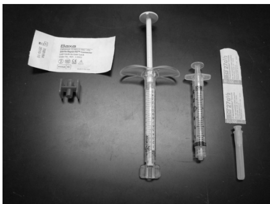
Figure 1: Left to right: Female-to-female luer lock connector, RADIESSE® syringe, 3.0cc mixing syringe, sterile 27 gauge, 0.5” needle